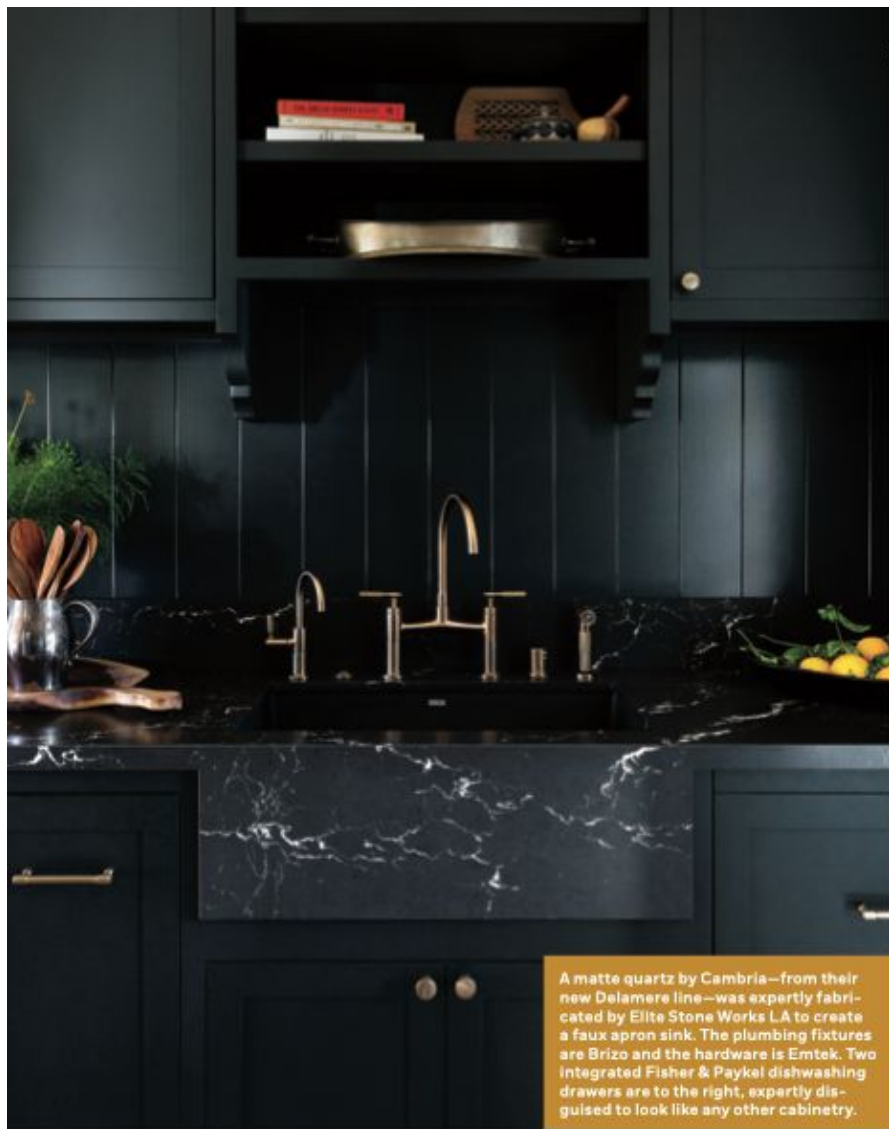
A matte quartz by Cambria—from their new Delamere line—was expertly fabricated by Elite Stone Works LA to create a faux apron sink. The plumbing fixtures are Brizo and the hardware is Emtek. Two integrated Fisher & Paykel dishwashing drawers are to the right, expertly disguised to look like any other cabinetry.