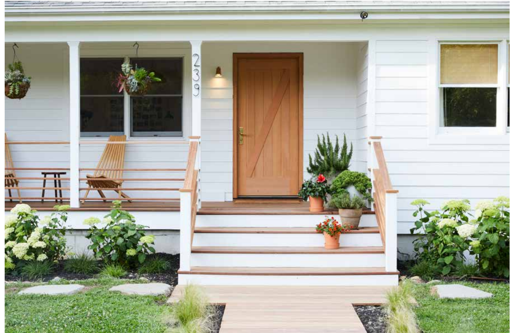
Design by Studio Robert McKinley @studiorobertmckinley | Athena Lever with Stretto 1.5x5 Rosette and Modern Thumbturn Privacy Bolt and 2"x10" Modern Rectangular Keyed Stretto Narrow Trim Lockset with Athena Lever in Unlacquered Brass.