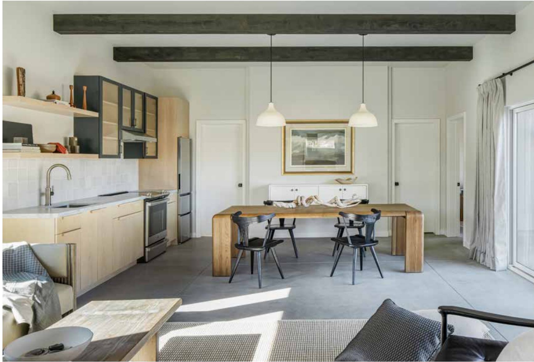
Design by Paul Heintz @pheintz @localstudiointeriors | Bern Knob with Square Rosette; Square Deadbolt; EMPOWERED™ Motorized Touchscreen Keypad Entry Set with Baden Grip. All hardware in Oil Rubbed Bronze.