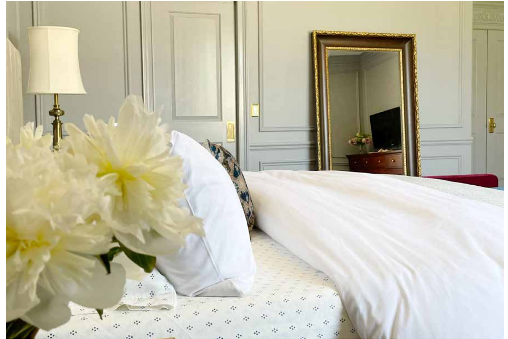
Design by Jeanne Navarro of Little Joy Market @littlejoymarket for @oneroomchallenge Egg Knob with Wilshire Non-Keyed 7" Sideplate; Modern Rectangular Flush Pull in French Antique.