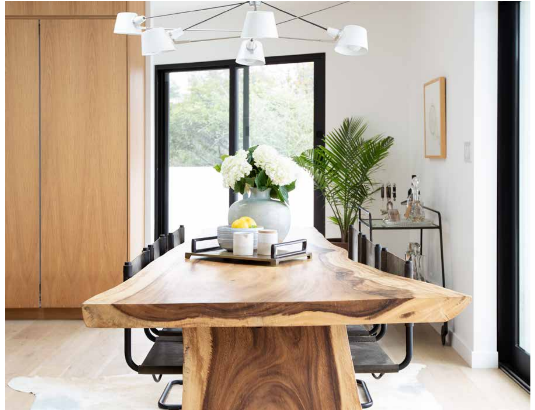
Design by Carly Waters Style @carlywatersstyle | Bern Knob with Disk Rosette and 3.5" Solid Brass Residential Duty Hinges in Flat Black.