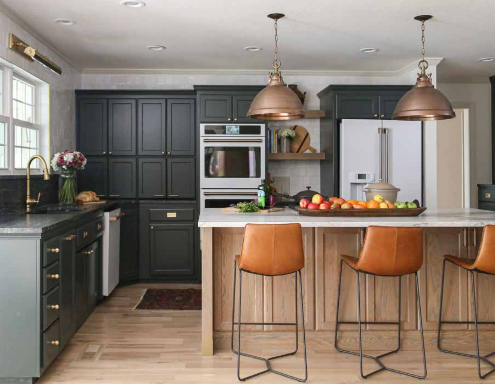
Design by Amanda Neely of CBC Builds @cbcbuilds Modern Rectangular Flush Pulls; Select Knurled Cabinet Pulls; Globe Knobs. All hardware in Satin Brass.