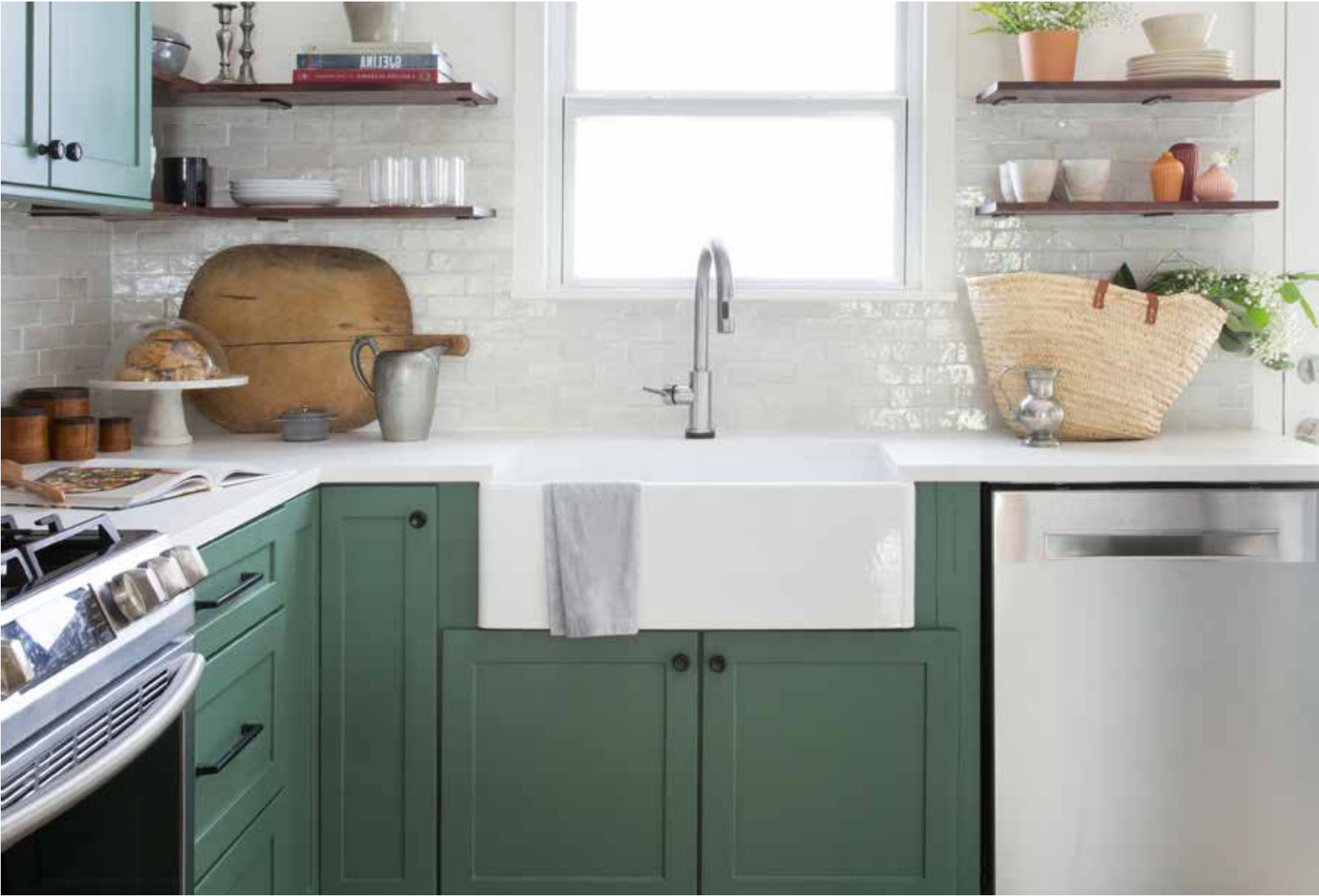
Design by Caroline Pinkston for Camille Styles @carolinepinkstonpr @camillestyles | Photography by @mollyculverphotography Atomic Cabinet Knob and Alexander Pull in Flat Black.