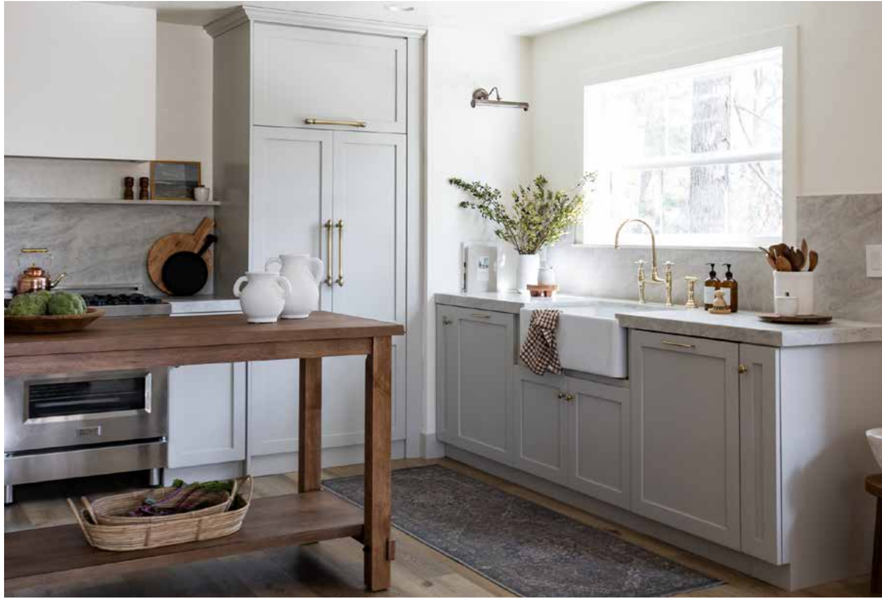
Design by Katie Staples @HalfwayWholeistic @elmwood_lake_house Wire Pulls, Spindle Appliance Pulls, Providence Knobs in French Antique, Butte Knob with Rectangular 7" Non-Keyed Sideplate in Flat Black Patina.