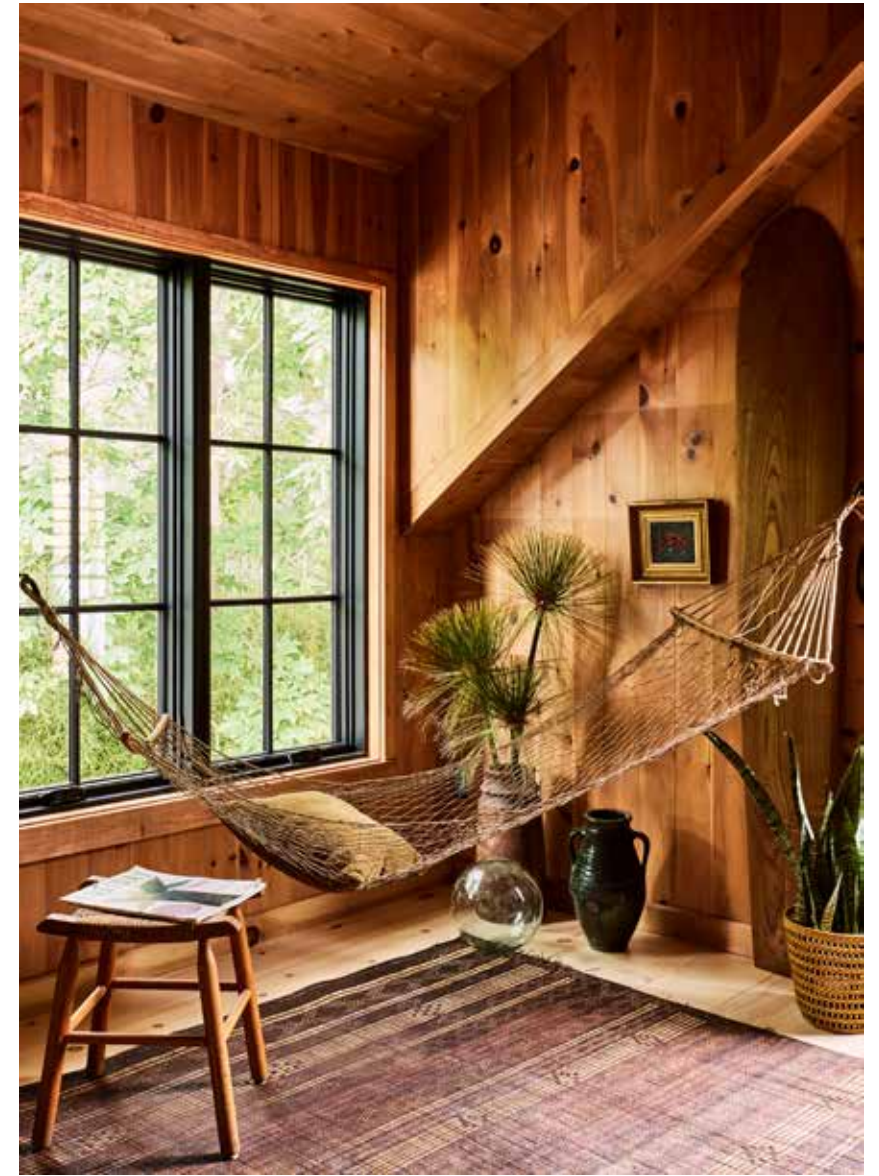
Design by Studio Robert McKinley @studiorobertmckinley Ice White Knob with Porcelain Rosette in Unlacquered Brass.