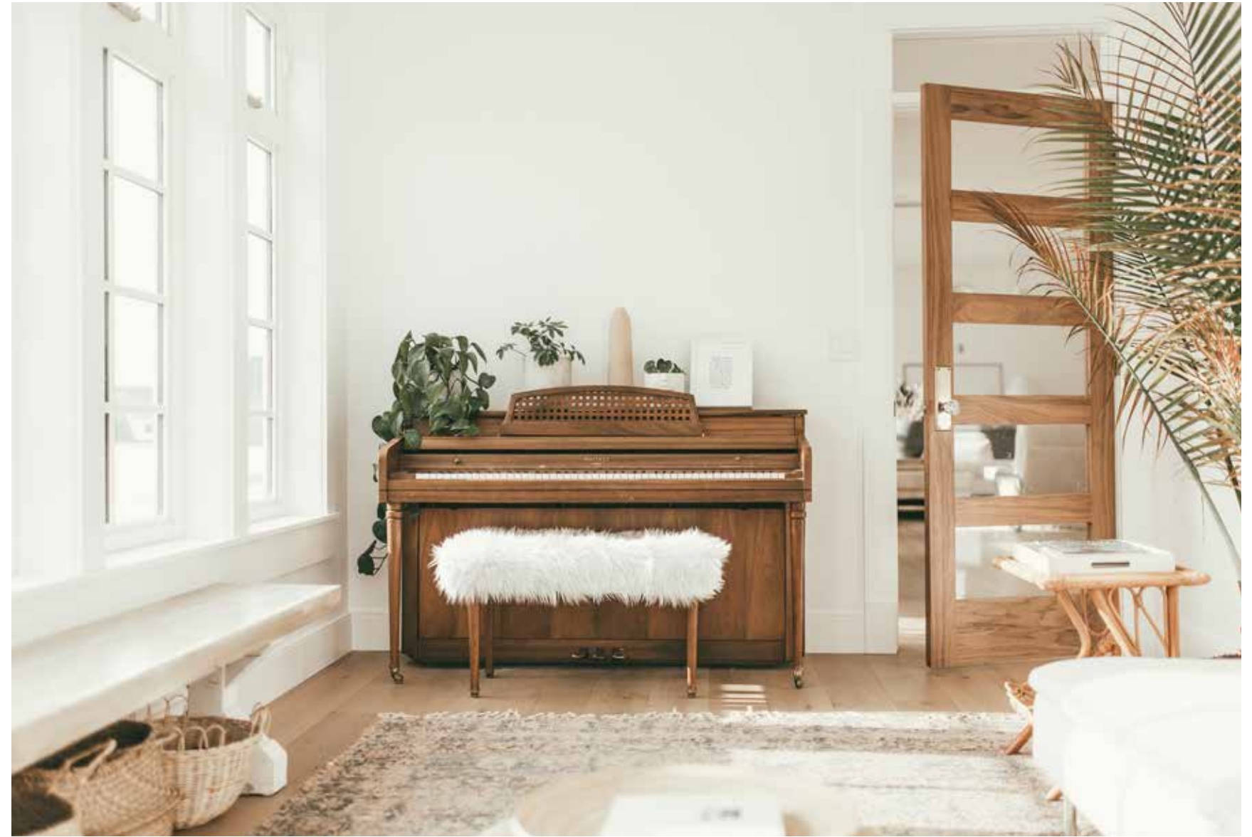
Design and Photography by Kelsie Millet @kelsieemm | Old Town Crystal Knobs with Quincy Sideplates in French Antique.