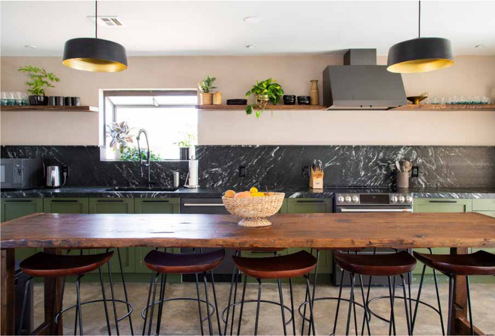
Design by West & Wild @westandwild | Bar Pulls in Oil Rubbed Bronze.