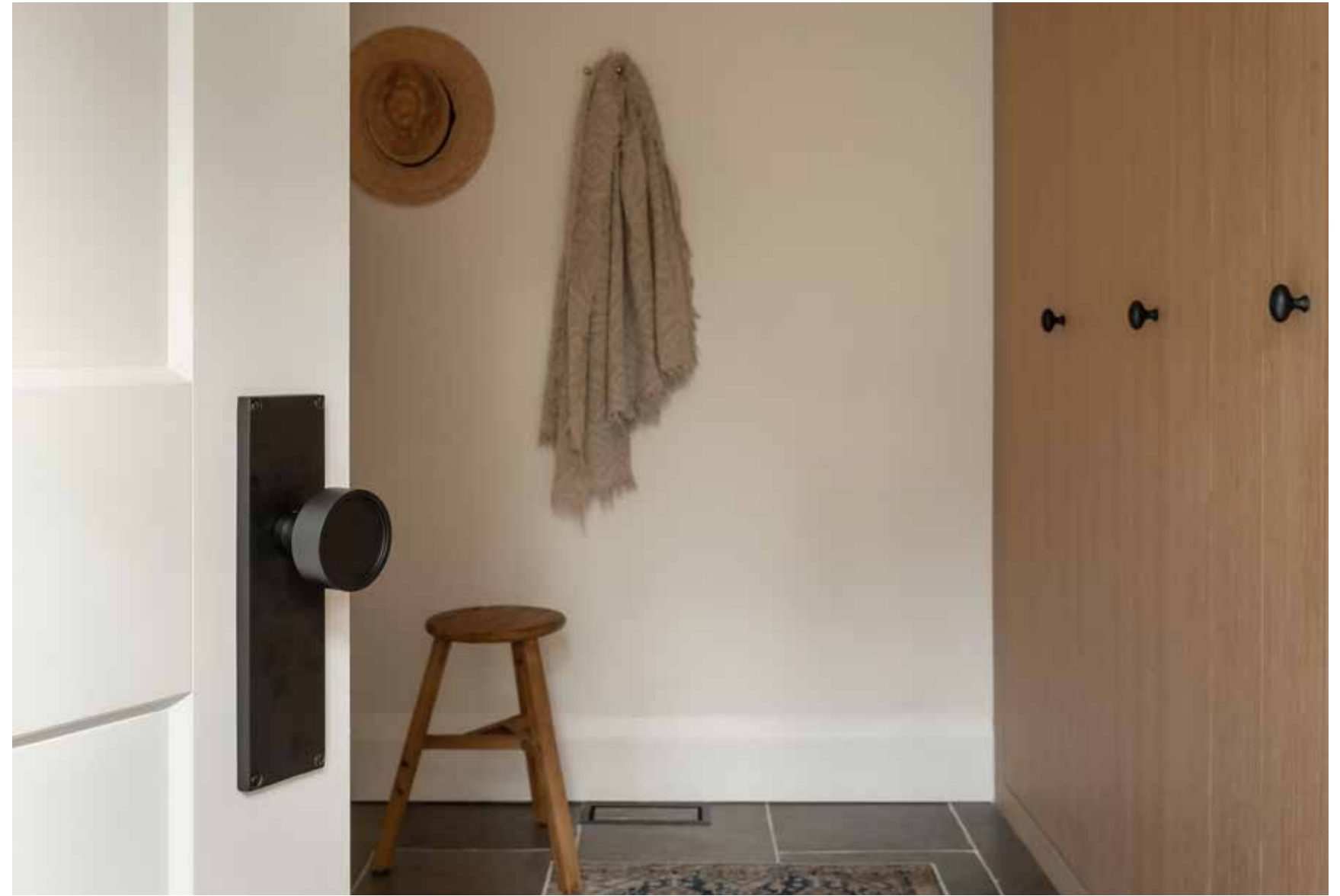
Design by Coco & Jack @coco.and.jack Lausanne Entry Set, Verve Knob with Modern Sideplate and Egg Cabinet Knob in Flat Black.