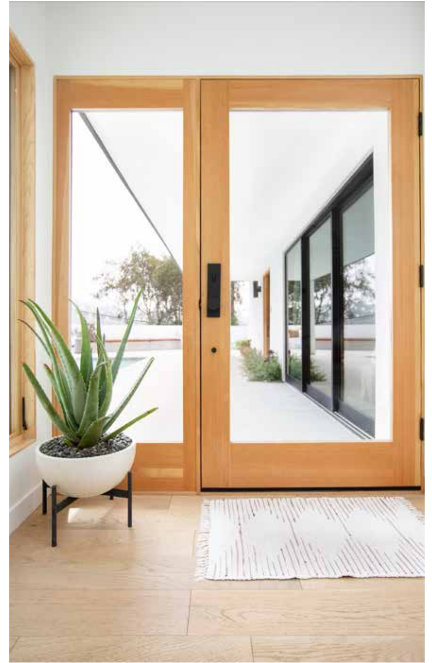
Design by Carly Waters Style @carlywatersstyle | Davos Entry Set with Bern Knob in Flat Black.