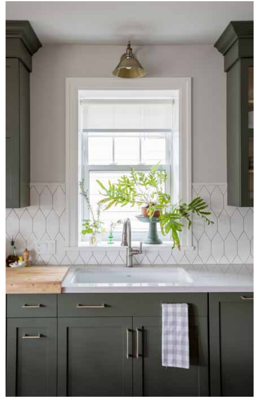
Design by Francesca Albertazzi @francescaalbertazzi | Photography by @pineconecamp | Greeley Entry Set with Teton Levers and Ice White Porcelain Knob with #11 Rosette in Flat Black Patina; Sandcast Bronze Rail Pull in Tumbled White Bronze.