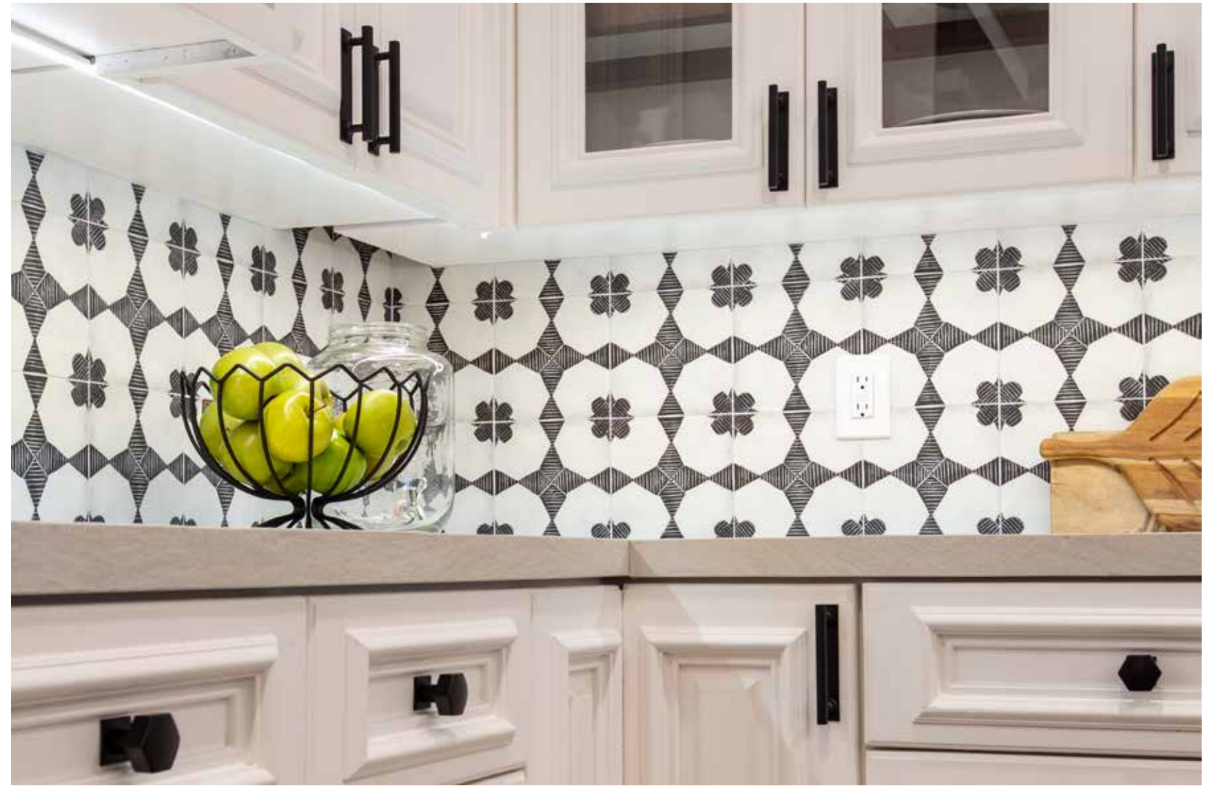
Design by Allison Knizek Design for Prescott Properties @a.k.nackfordesign Turino Lever with Regular Rosette in Oil Rubbed Bronze; Art Deco Square Backplate with Mod Hex Cabinet Knob, Art Deco Rectangular Backplate with Freestone Cabinet Pull in Flat Black.