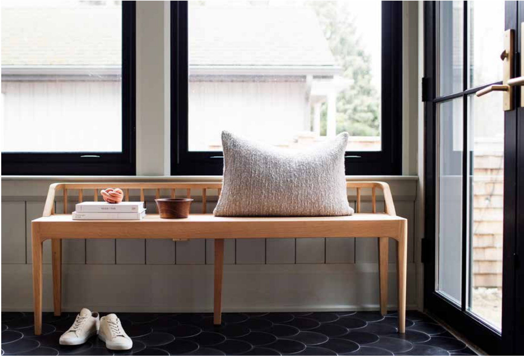
Design by Marcella Dilonardo @modestmarce | Multipoint with Stuttgart Lever in Satin Brass and Flat Black.