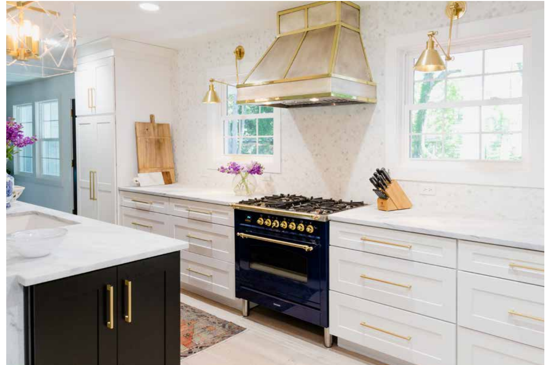
Design by Krystine Edwards @krystine_edwards Modern Rectangular Face Mount Barn Door Track, with Spoke Wheel in Flat Black; Alexander Pull in Satin Brass. Trail Pulls in Satin Brass.