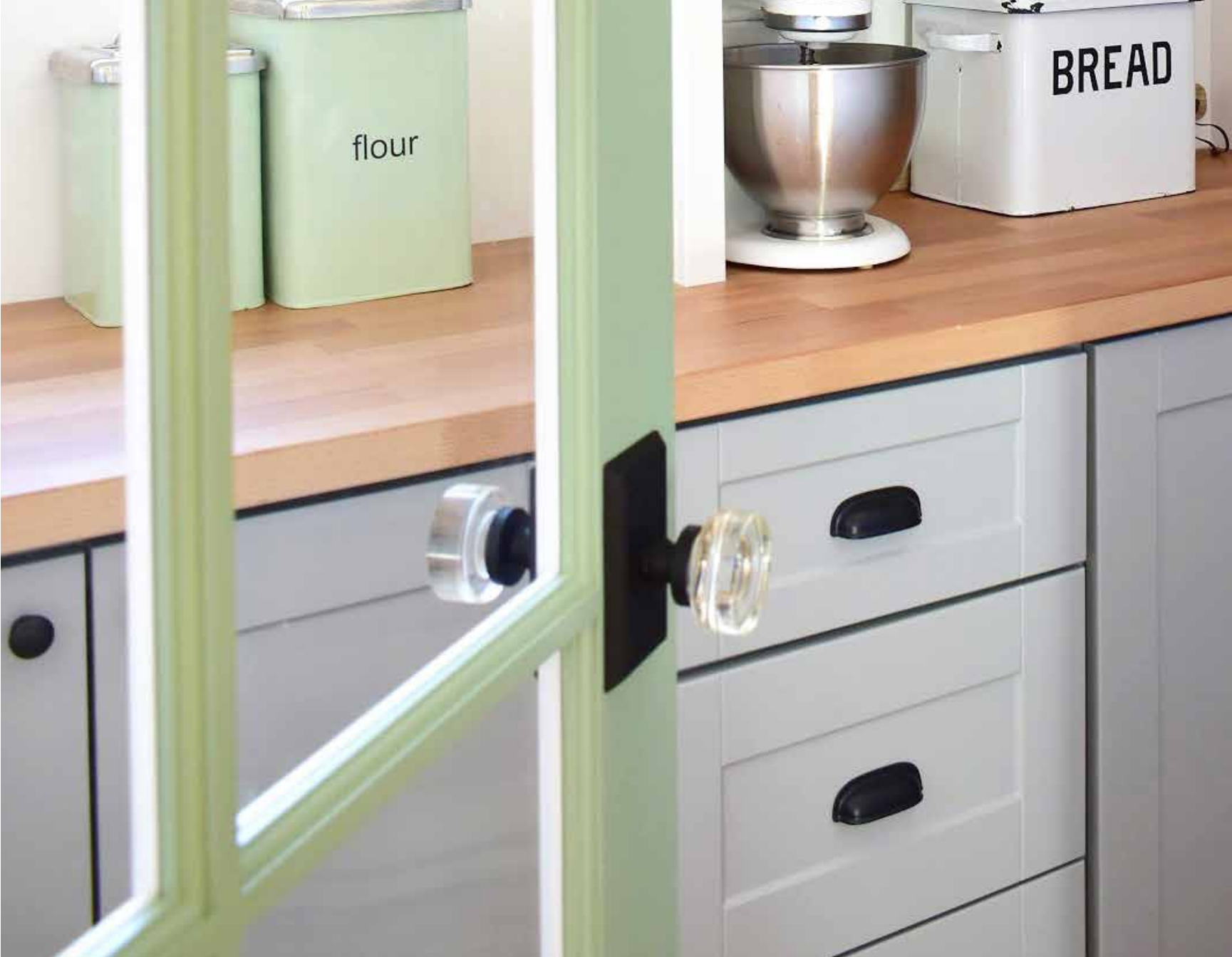
Design by Kari Fiagle @ourfigtreecottage | Modern Disc Crystal Knob with Rectangular Rosette; Wilshire Entry Set. All hardware in Flat Black.