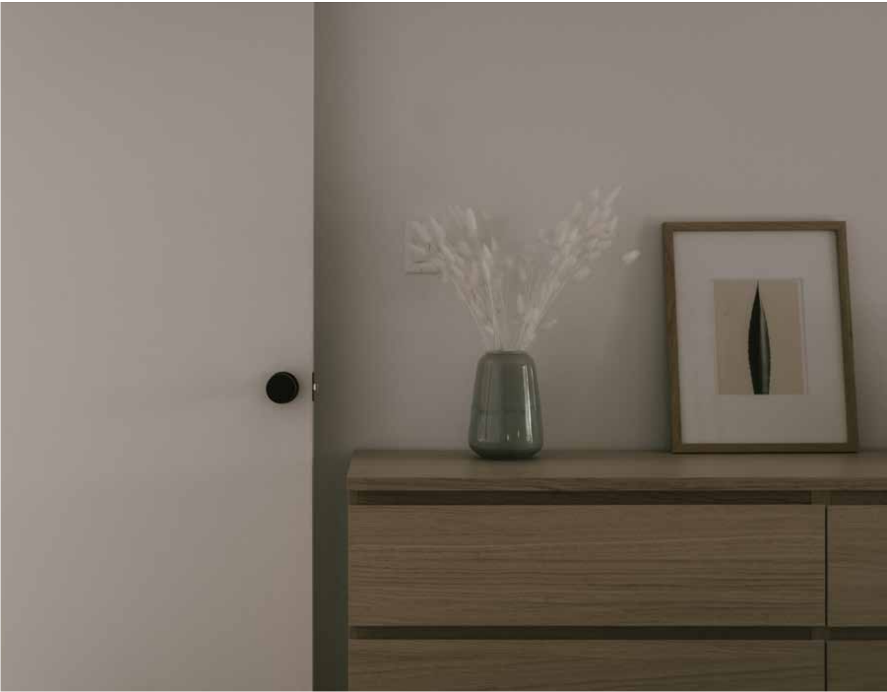
Design and Photography by Carlos Naude @workingholidaystudio @workingholidayspaces Select Straight Knurled Knobs with Disk Rosette in Flat Black.