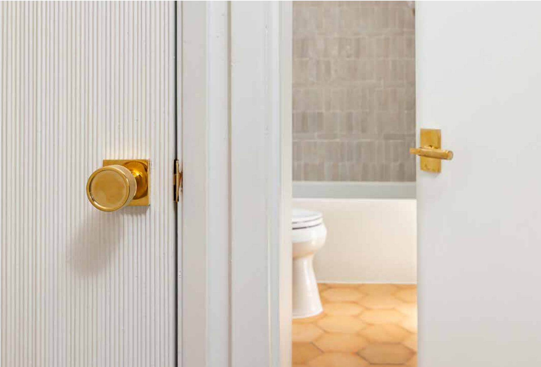
Design by Sachi Lord of Lord Design Co. @Sachilord for @oneroomchallenge Select Knurled Knob with Square Rosette and Select L-Square Knurled Lever with Modern Rectangular Rosette in Unlacquered Brass.