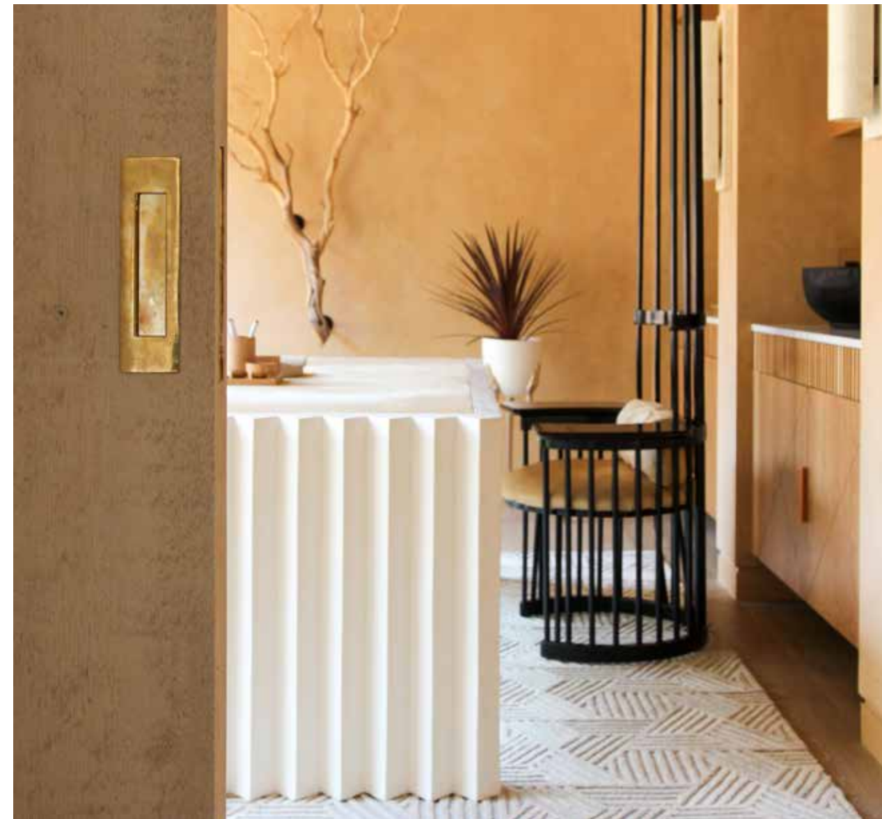
Design by Homme Boys @hommeboys | Vinci Natural Bronze Pulls by Schaub & Company. Select T-Bar Straight Knurled Lever with Disk Rosette; Cabinet Edge Pulls; Modern Rectangular Flush Pulls. All hardware in Unlacquered Brass.