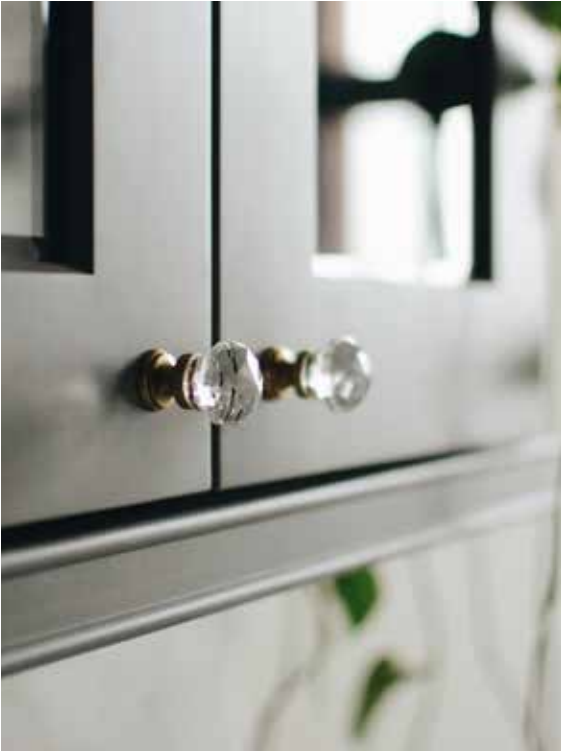
Design and Photography by Greg Birman @gregbirman | Modern Bath Hardware in Flat Black; Tribeca Pulls, Diamond Crystal Cabinet Knobs, District Cabinet Knob and Freestone Pulls in Satin Brass.