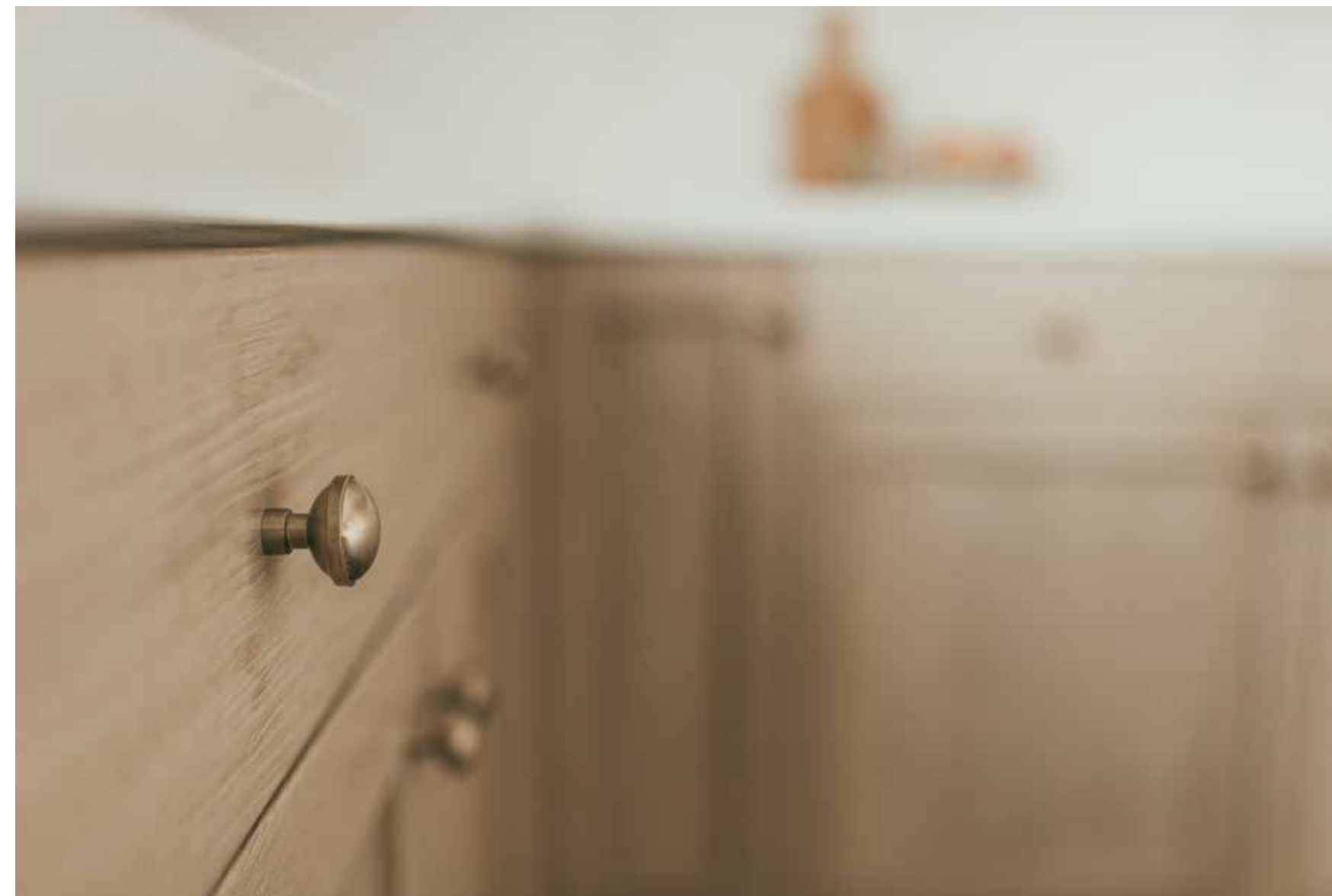
Brandt Knob in Satin Brass.